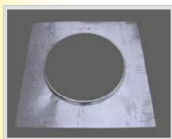
Top Plate Similar Bottom Plate